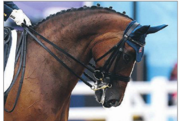
Rafalca, in competition yesterday, placed 13th among 25.

The teenager in question is the horse Rafalca, the most famous American athlete on more than two legs at these Olympics. But his renown is due only partly to his prowess in the esoteric sport of dressage, best described for the unknowing as an intricate form