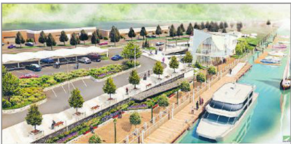
Rendering of the proposed ferry terminal in Glen Cove

Three more U.S. horses are set to go today, with the top seven national teams advancing to a final round Tuesday.